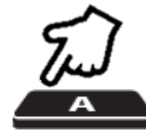
Anchored Key Caps