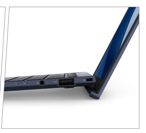
With ErgoLift hinge, the keyboard automatically tilts to the most comfortable typing positions