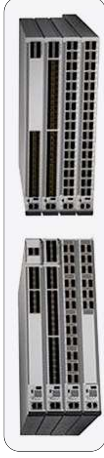
Figure 4. Catalyst 9500 Series

This is enabled by a multiple slice (discreet processing pipeline) internal architecture that includes an on-chip 2.5D High Bandwidth Memory (HBM). The Catalyst 9500 Series leverages a high-performance multiple core x86 CPU, and is Cisco’s leading purpose-built fixed core and WAN edge services enterprise switching platform, built for security, IoT, and cloud.