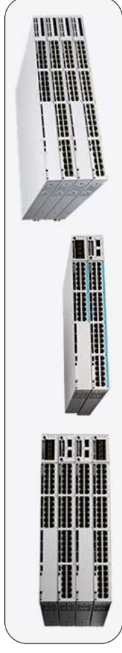
Figure 2. Catalyst 9300 Series

faster. Offering up to 1 Tbps of mixed fiber and copper stacking capacity, multigigabit, and 90W UPOE+, the Catalyst 9300 Series offers options from large to small.