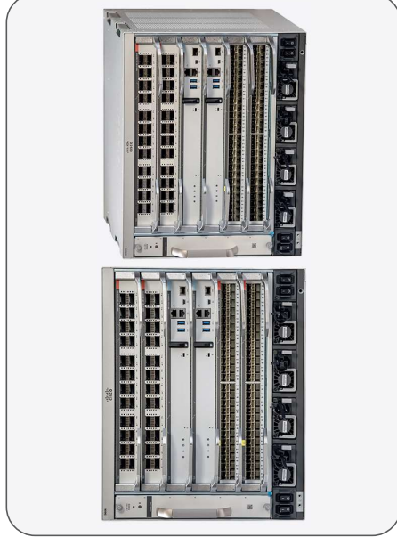
Figure 5. Catalyst 9600 Series

the first network silicon to offer switching capacity up to 25.6 Tbps (12.8 Tbps full-duplex) in the enterprise. The Q200 ASIC offers high-performance along with full routing and switching capabilities without external memories. This is enabled by a multiple slice (discreet processing pipeline) internal architecture that includes an on-chip 2.5D High Bandwidth Memory (HBM). The Catalyst 9600 Series leverages a high-performance multiple core x86 CPU, and is Cisco's leading purpose-built modular core and WAN edge services enterprise switching platform, built for security, IoT, and cloud.