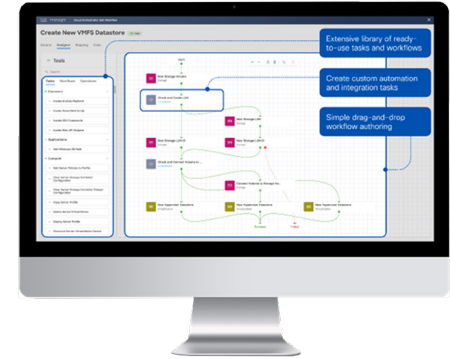
Figure 2. Accelerate delivery of applications and infrastructure using a drag-and-drop automation and workflow designer