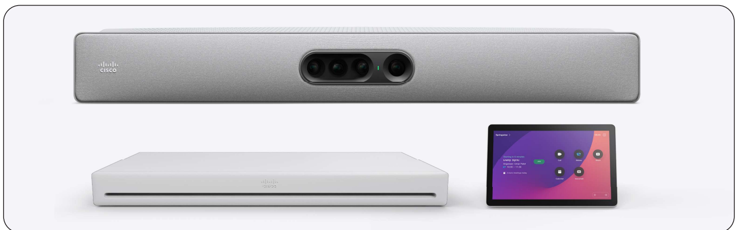
Figure 2. Main components of the Cisco Room EQ bundle: Cisco Codec EQ, Cisco Quad Camera, and the Cisco Room Navigator touch controller