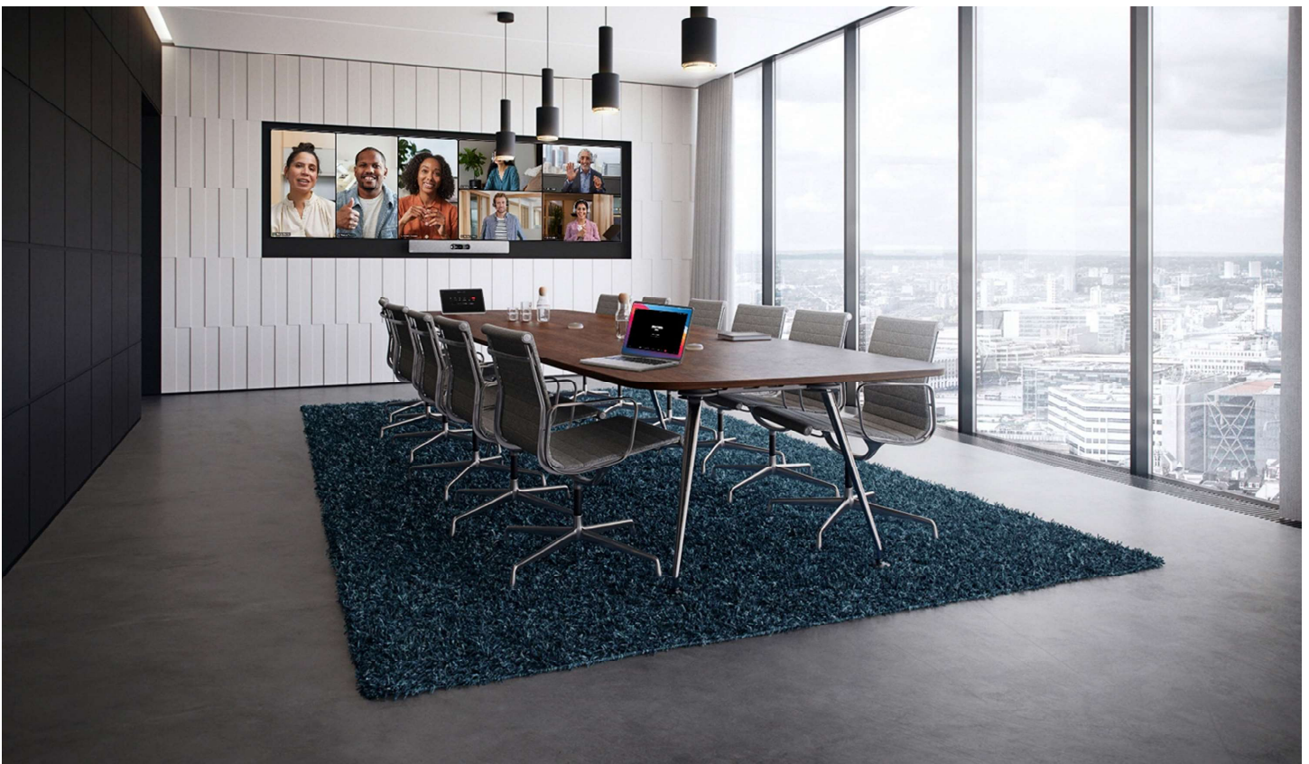
Figure 1. The Cisco Room Kit EQ in a conference room with the Quad Camera, the table-stand Room Navigator, and the Cisco Table Microphone Pro.

The Room Kit EQ provides optionality and extensibility with a highly modular setup to easily add touch controllers, cameras, speakers, microphones, and other room peripherals – easing the configuration and scaling of complex, multi-component audiovisual environments. This solution is rich in functionality and experience yet easy to deploy, maintain, and scale to your workspaces – and comes with unified cloud device management and workspace analytics in Control Hub.