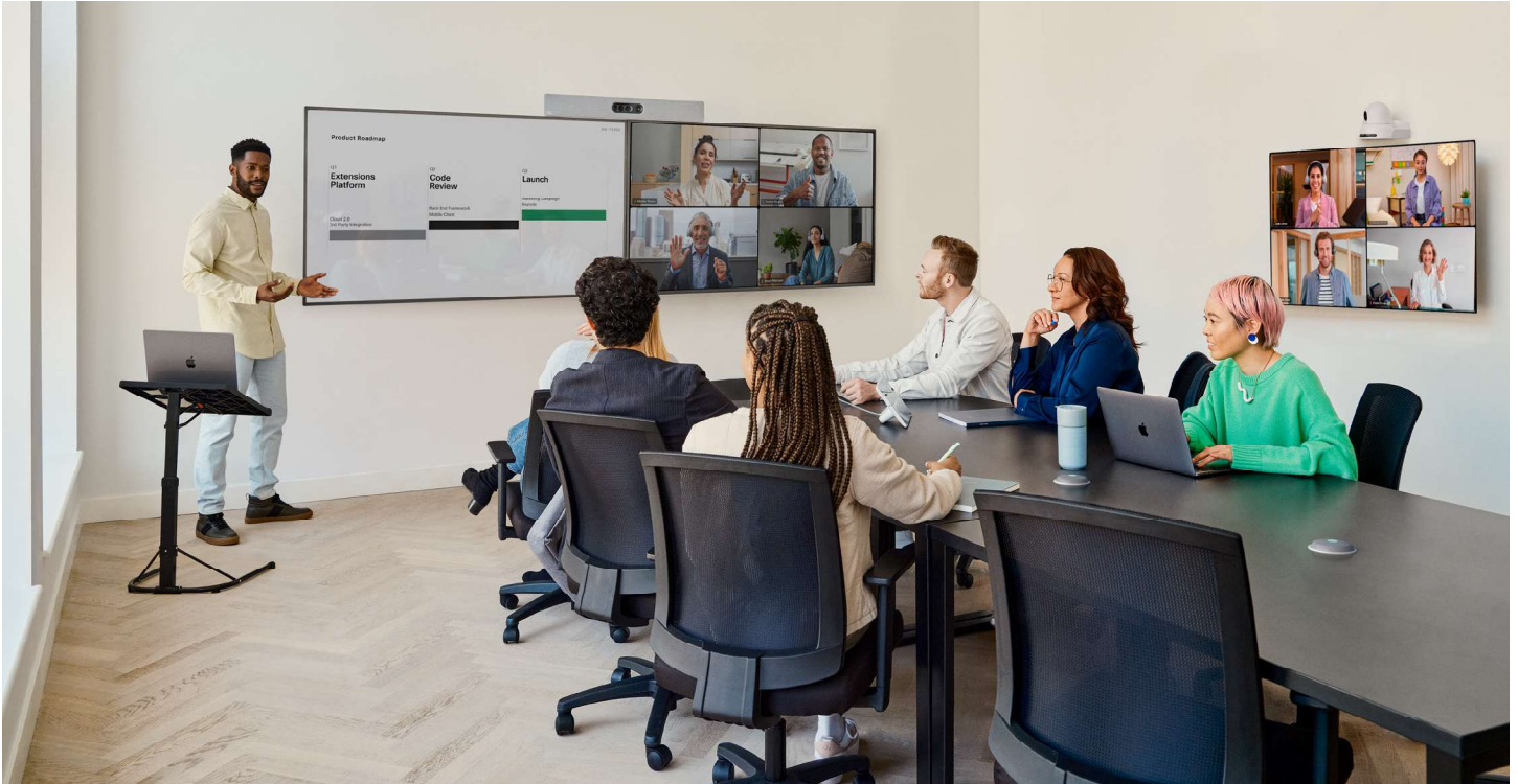
Figure 3. Cisco Room Kit EQ in a large training room featuring the Quad Camera, the PTZ 4K Camera, the Room Navigator tabletop touch controller, and Cisco Table Microphone Pro devices.