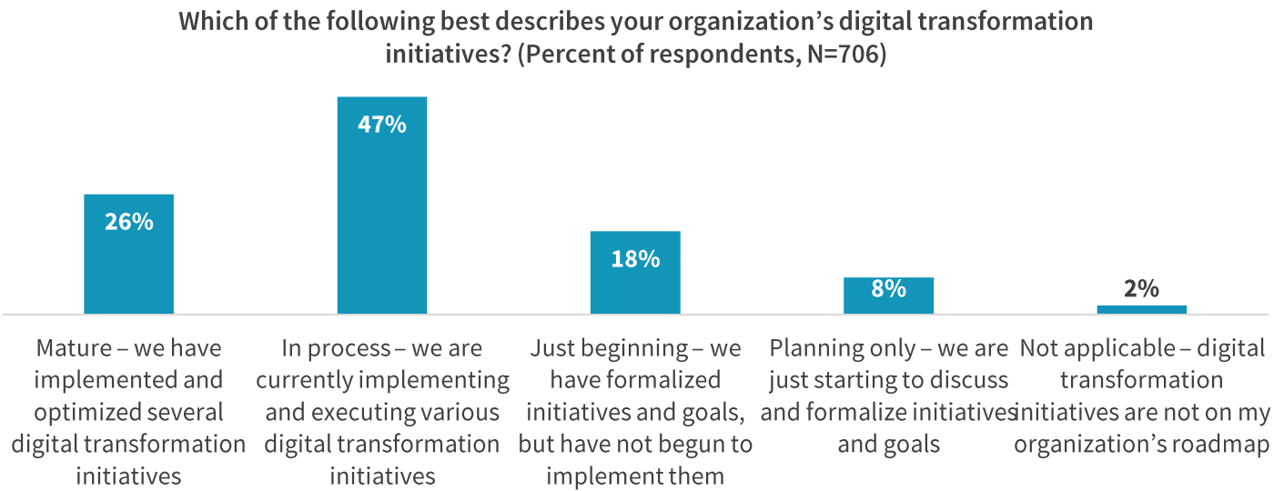
Figure 1. Digital Transformation Driving Modern IT Environments