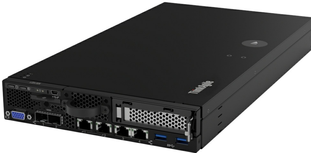
Figure 2. ThinkAgile MX1021 Certified Node

The new ThinkAgile MX1021 offering from Lenovo combines these features with the Azure Stack HCI capabilities of Windows Server 2019 Datacenter Edition to provide the perfect combination of hybrid computing for the edge.