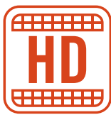
HD VIDEO QUALITY

The reliable build and efficiencies that are created by the camera and the software were a value-added benefit. Crime Analyst, Corporal Ryan Droege says the high-end cameras were a good investment because the HD video quality works well in low-light, they have a great storage capacity, a long-life battery and the software is easy to use.