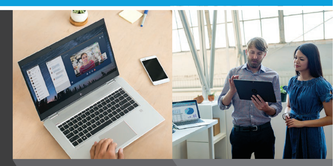
A wide variety of device choices