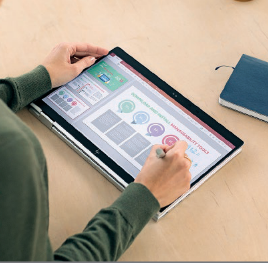
Flexible plans with a simple, predictable price