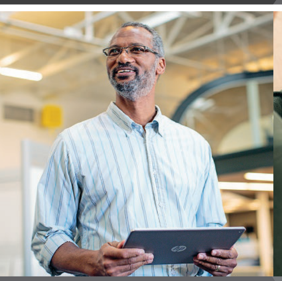
Insightful and predictive analytics from TechPulse