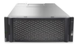
Lenovo DE Series Disk Storage System**

CDW has partnered with Veeam and Lenovo to deliver a solution offering powerful protection