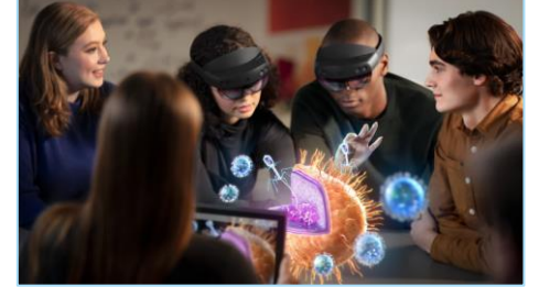
HoloLens 2 Development Edition