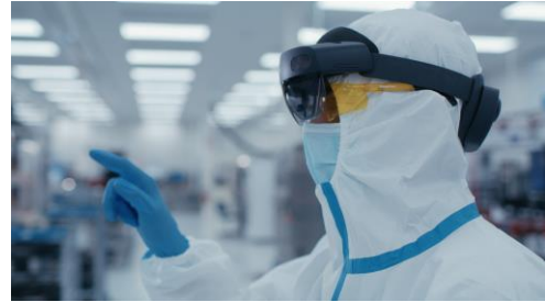
HoloLens 2 Industrial Edition