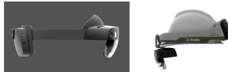
Market leading mixed reality mounted display for commercial customers