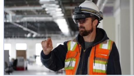
Trimble XR10 with HoloLens 2