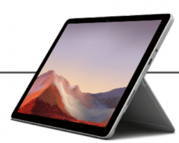
Surface Go 2

Delivering value across the healthcare industry