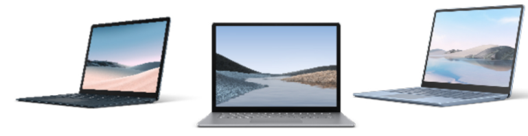
Surface Laptop 3 Surface Laptop Go