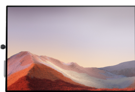
Surface Hub 2S