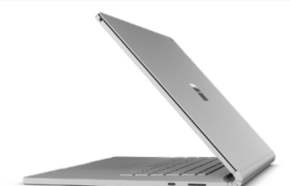
Surface Book 3 (15")

Mobile care givers, Telehealth workers NHS Pro EMS