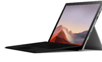
Surface Pro 7