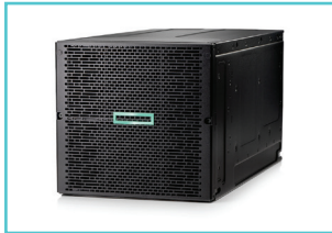
HPE Edgeline EL8000 Converged Edge System

222 mm W x 220 mm H x 431 mm D (8.7" W x 8.6" H x 16.9" D)