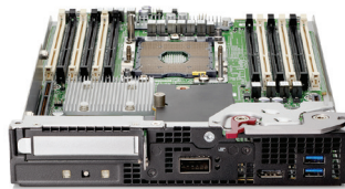
HPE ProLiant e910 Server Blade 1U