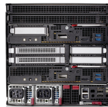
HPE Edgeline EL8000