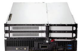
HPE ProLiant e910 Server Blade 2U