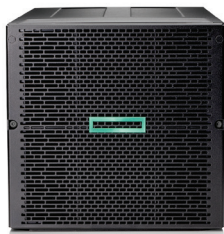
HPE Edgeline EL8000