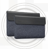
Lenovo Yoga Sleeves