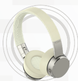
Lenovo Yoga Active Noise-cancellation Headphones