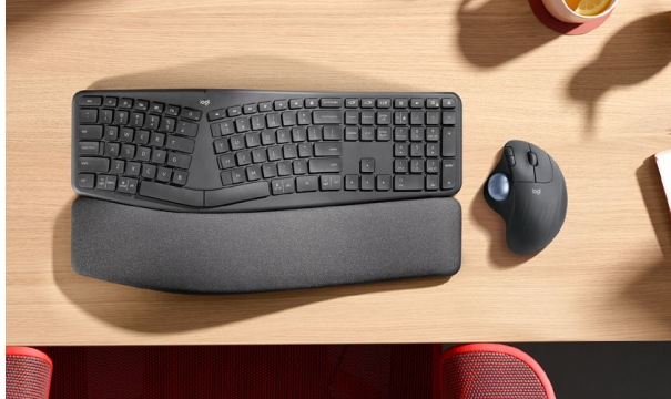
Logitech ERGO K860 Ergonomic Split Keyboard for Business and M575 Trackball Mouse for Business

Logi Bolt works with just about every operating system and platform including—but not limited to—Windows®, macOS®, Linux® 3 , Chrome OS™ 3 , Android™ 4 , iOS® 4 and iPadOS®. In fact, Logi Bolt devices are more universally compatible than most leading peripheral brands on the market.