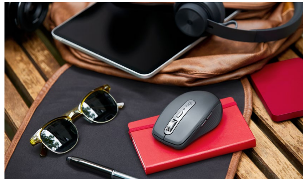
Logitech MX Anywhere 3 Mouse for Business

3. Logi Bolt wireless products will not pair with other Logitech USB receivers.