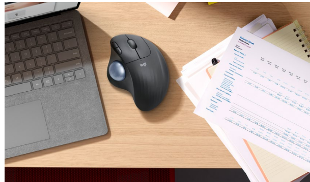
Logitech ERGO M575 Mouse for Business

2. Logi Bolt wireless products will not pair with other Logitech USB receivers.