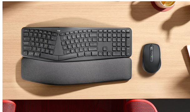
Logitech ERGO K860 Ergonomic Split Keyboard for Business and MX Anywhere 3 Mouse for Business