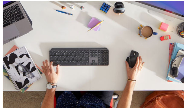
Logitech MX Keys for Business and Logitech MX Master 3 Mouse for Business