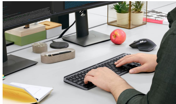
Logitech MX Keys for Business