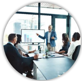
The Executive Branch

Keeping pace demands action at all levels