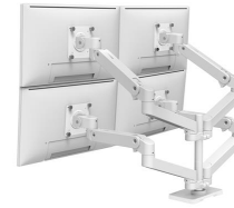
LX Pro Quad Arm Bundle