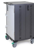
YES36 Adjusta PW Charging Cart