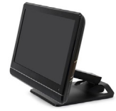
Neo-Flex® Touchscreen Stand