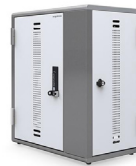
YES20 Charging Cabinet