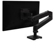
LX Pro Surface Monitor Arm