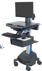
StyleView® Cart with LCD Pivot

▶ Mobile carts create a versatile check- out solution!