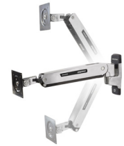
Interactive Arm, LD