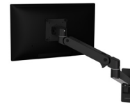
LX Pro Wall Monitor Mount