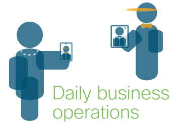
Daily business operations