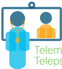
Telemedicine and Telepsychiatry