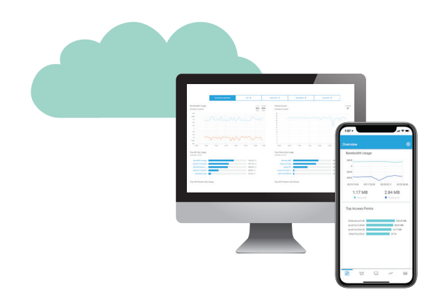
Figure 2. Aruba Central's cloud-based, mobile-friendly management platform