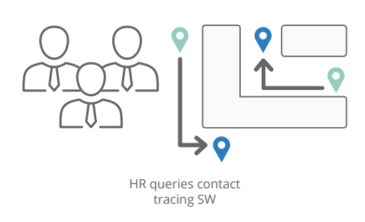
Figure 2: Aruba AIOps Uses Smart Telemetry and AI Modeling to Power Location Solutions

Data streamed to visualization and AI/ML Proximity Models