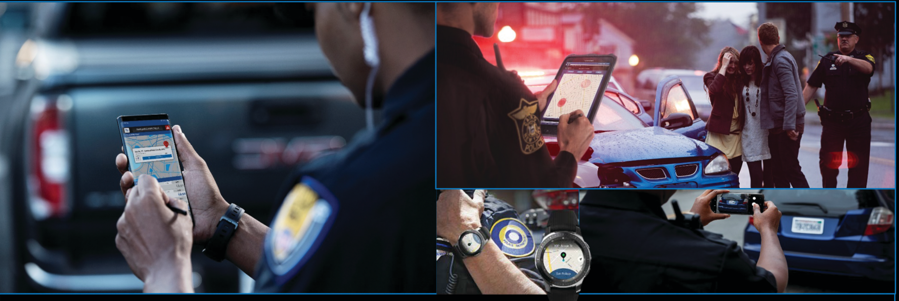
BWCs Push to Talk Mobile Computer Aided Dispatch eCitations Parking Enforcement

Field Checks Social Distancing Response Evidence Collection Field Interviews <u>Situational Awar</u>eness