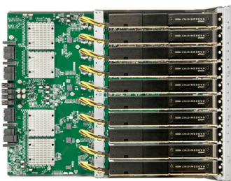
FIGURE 4. AMD Instinct MI100 GPU with Infinity Fabric™ Link

Yet modern AI workloads are already pushing the boundaries of accelerated computing. Now, savvy organizations are looking for cutting-edge solutions to unleash the full power AI, gain competitive advantage, and solve some of the world's biggest problems.