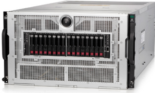
FIGURE 1. HPE Apollo 6500 Gen10 Plus System