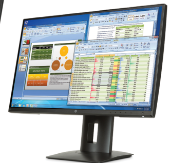
HP Z Displays

Features for the enhanced user experience