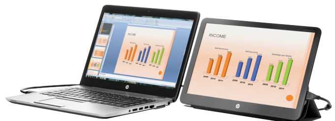
HP S140u Portable Monitor

Give your mobile workers an advantage in the office. They can pair their on-the-go PC with all the extra screen space they need at their desk—simply connect their notebook via a docking station or create an instant multi-screen workspace with a USB cable and the HP EliteDisplay S231d Docking Monitor.