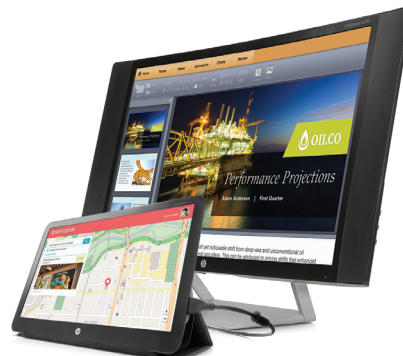
HP EliteDisplays S-Series

Comfort-focused, energy efficient with advanced connectivity