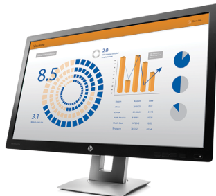
HP EliteDisplay E-Series

Affordable, energy efficient monitors for growing success