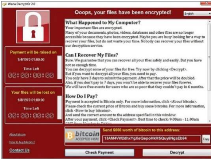
Figure 1: Ransom note left on systems infected by WannaCry ransomware

The most common method is via hard drive encryption. Once a system is infected, ransomware may encrypt specific data or entire hard drives, then spread from system to system. Other variants lock users out of their workstations or servers while a lock screen with a ransom message fills the monitor (see Figure 1 ). In all scenarios, the data or system is unusable until the attacker's ransom is paid in full.