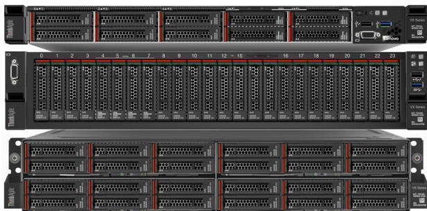
VX Certified Nodes, above: 1U top, 2U middle, and 2U/4-node bottom.