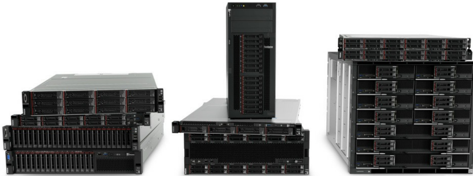
Figure 1. ThinkSystem servers include the XClarity Controller integrated service processor

Most Lenovo ThinkSystem servers contain an integrated service processor, XClarity Controller (XCC), which provides advanced service-processor control, monitoring, and alerting functions. The XCC consolidates the service processor functionality, super I/O, video controller, and remote presence capabilities into a single chip on the server system board. The XCC is based on the Pilot4 XE401 baseboard management controller (BMC) using a dual-core ARM Cortex A9 service processor.