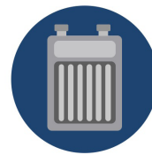
Cisco LoRaWAN gateways

All the technology you need, integrated and ready to go