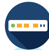
New! Cisco industrial sensors