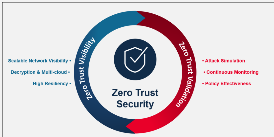
Figure 1. Zero Trust Visibility & Validation Lifecycle Solution

Tools like NGFW, SIEM, asset discovery, end point detection (EDR) all play an important part in your cybersecurity framework. But are you sure that these tools are getting all the data they need to do their jobs? And are you also sure that they have been implemented and configured correctly? It is recommended that the Zero Trust mindset must apply to visibility to your security tools and then validation that these tools are working correctly.