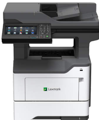
Devices built to last