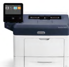
Xerox® VersaLink B400 Printer