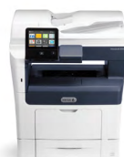
Xerox® VersaLink B405 Multifunction Printer