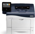
Xerox® VersaLink® C400 Color Printer