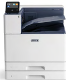
Xerox® VersaLink C9000 Color Printer