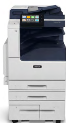
Xerox® VersaLink C7120/C7125/ C7130 Color Multifunction Printer