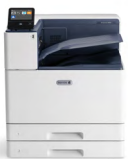
Xerox® VersaLink C8000 Color Printer