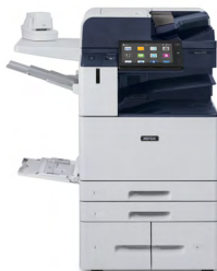
Xerox® AltaLink® C8130/C8135/ C8145/C8155/ C8170 Color Multifunction Printer