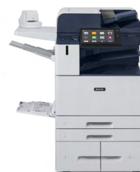
Xerox® AltaLink B8145/B8155/ B8170 Multifunction Printer

To learn more about Xerox® ConnectKey Technology, go to www.ConnectKey.com .