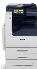
Xerox® VersaLink B7125/B7130/ B7135 Multifunction Printer