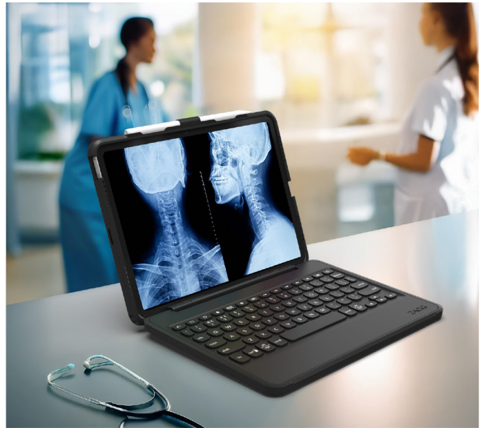
ZAGG Rugged Book

In hospitals and clinics, every second matters. Healthcare professionals rely on their mobile devices to access patient records, communicate with colleagues, and make critical decisions. ZAGG ensures these devices are always ready—powered, protected, and performing at their best.