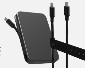
Power/ Charging Cables