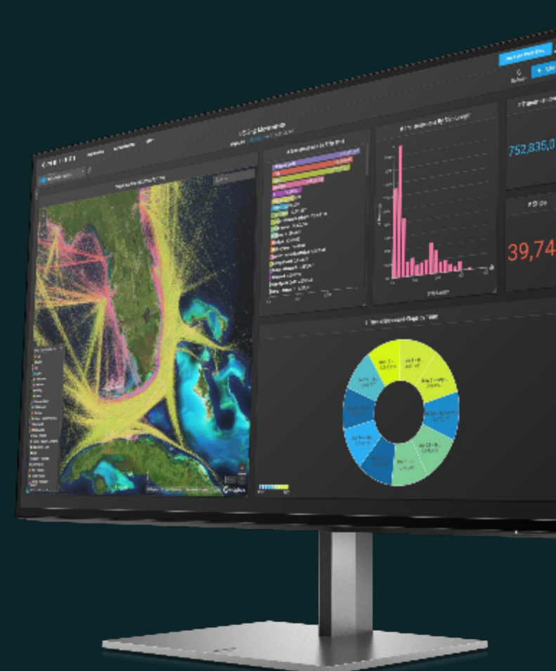
World's first 27" 4K monitor with 100W USB-C ® Power Delivery 6

Sustainability Make a conscious choice with this monitor that's been built with the environment in mind. Its plastics consist of over 80% recycled materials 3 plus it has 100% sustainably sourced and recyclable packaging 4 . It is ENERGY STAR ® certified and EPEAT ® registered 5