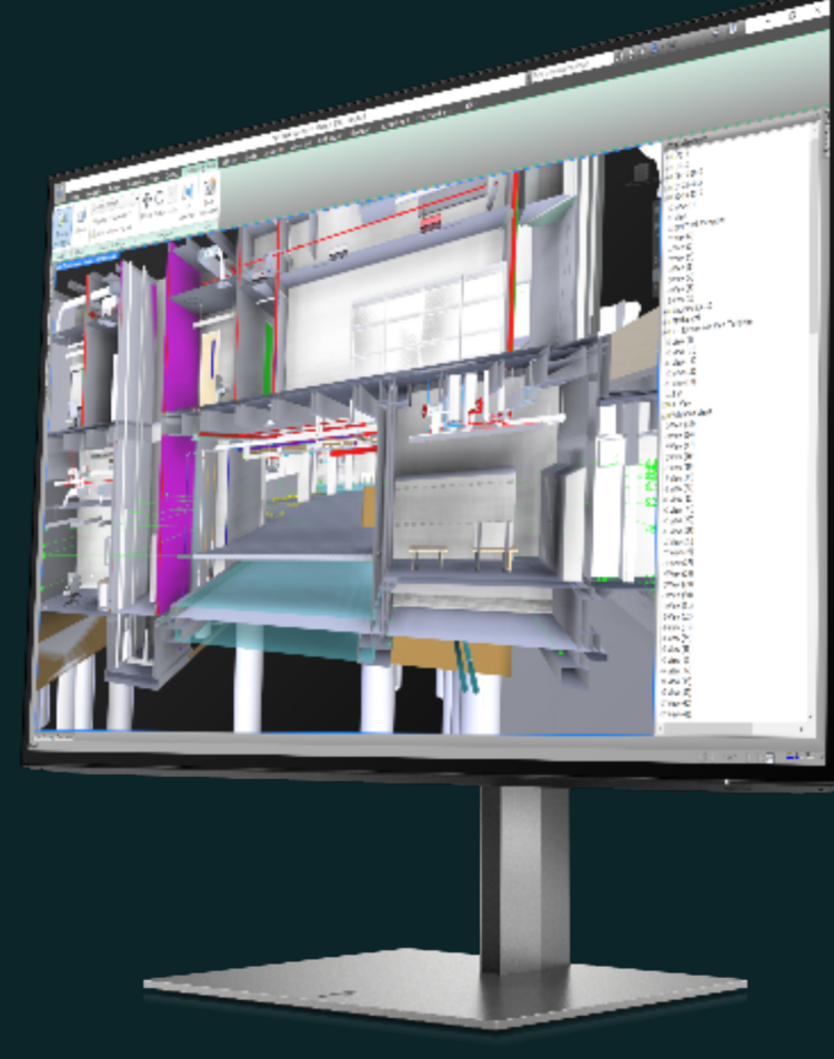
World's first 16:10 monitor with 100W USB-C ® Power Delivery 6

Sustainability Make a conscious choice with this monitor that's been built with the environment in mind. Its plastics consist of over 80% recycled materials 3 plus it has 100% sustainably sourced and recyclable packaging 4 . It is ENERGY STAR ® certified and EPEAT ® registered. 5