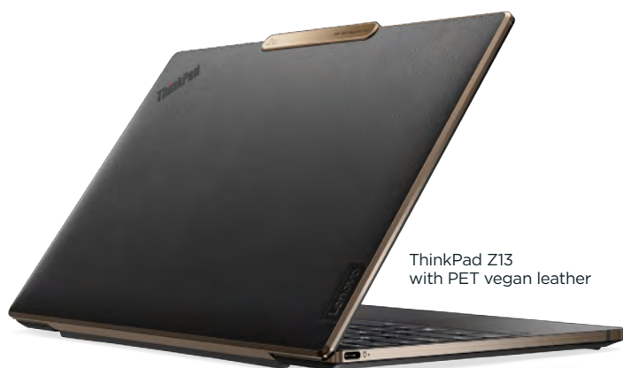
ThinkPad Z13 with PET vegan leather

The Z Series is packaged for retail in recyclable bamboo and sugar cane materials that are 100% home-compostable and can also be recycled as paper.