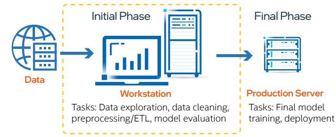
Figure 1. Typical AI/ML workflow.

Supporting the workflow of data scientists requires systems that are highly interactive and can handle massive volumes of data, using tools designed for single-node processing.