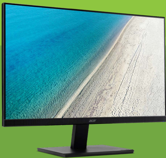
Acer Commercial LCDs