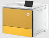
HP Color LaserJet Enterprise X55745dn shown in Constellation Yellow color panel option