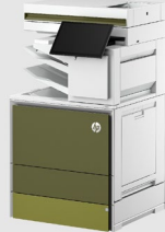
HP Color LaserJet Enterprise Flow MFP X57945zs shown in Cosmic Green color panel option