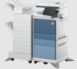
HP Color LaserJet Enterprise Flow MFP X677z+ shown in default Atmosphere Blue color panel option