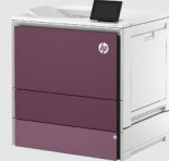
HP Color LaserJet Enterprise X654dn shown in Aurora Purple color panel option