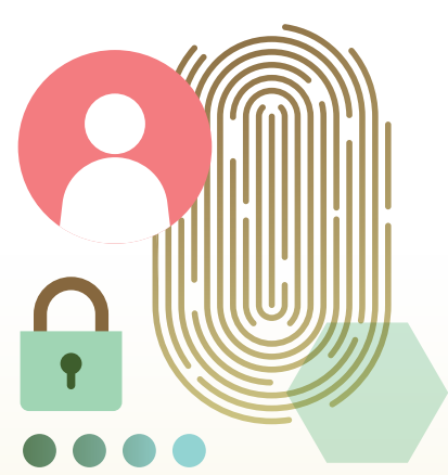
Optional Fingerprint Reader