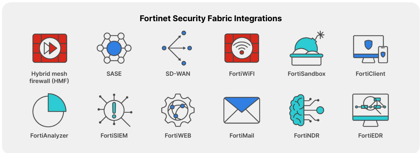
Figure 2: Fortinet products and solutions that integrate FortiGuard AI-Powered Security Services

The Security Fabric is built on the FortiOS operating system, common industry standards, and open APIs, allowing you to easily connect and maximize the value of your existing investments. This unified framework also enables a proactive security posture, ensuring your defenses are always aligned and responsive to emerging threats.