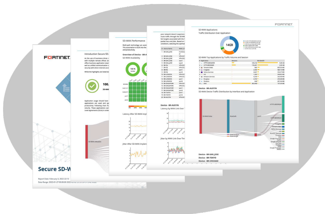
Figure 2: Detailed and highly configurable SD-WAN reports save the IT team valuable time.

Fortinet accelerates compliance reporting by simplifying security infrastructure and eliminating the need for many manual processes. FortiManager and FortiAnalyzer include customizable regulatory templates as well as canned reports for standards such as Payment Card Industry Data Security Standard, Security Activity Report, Center for Internet Security, and National Institute of Standards and Technology. They also provide detailed audit logging and role-based access control to ensure that employees can only access the information they need to perform their jobs.