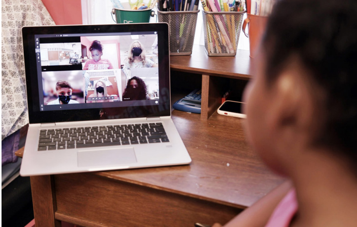
Photo (Above & Right): HP EliteBook laptop for real-time remote learning.