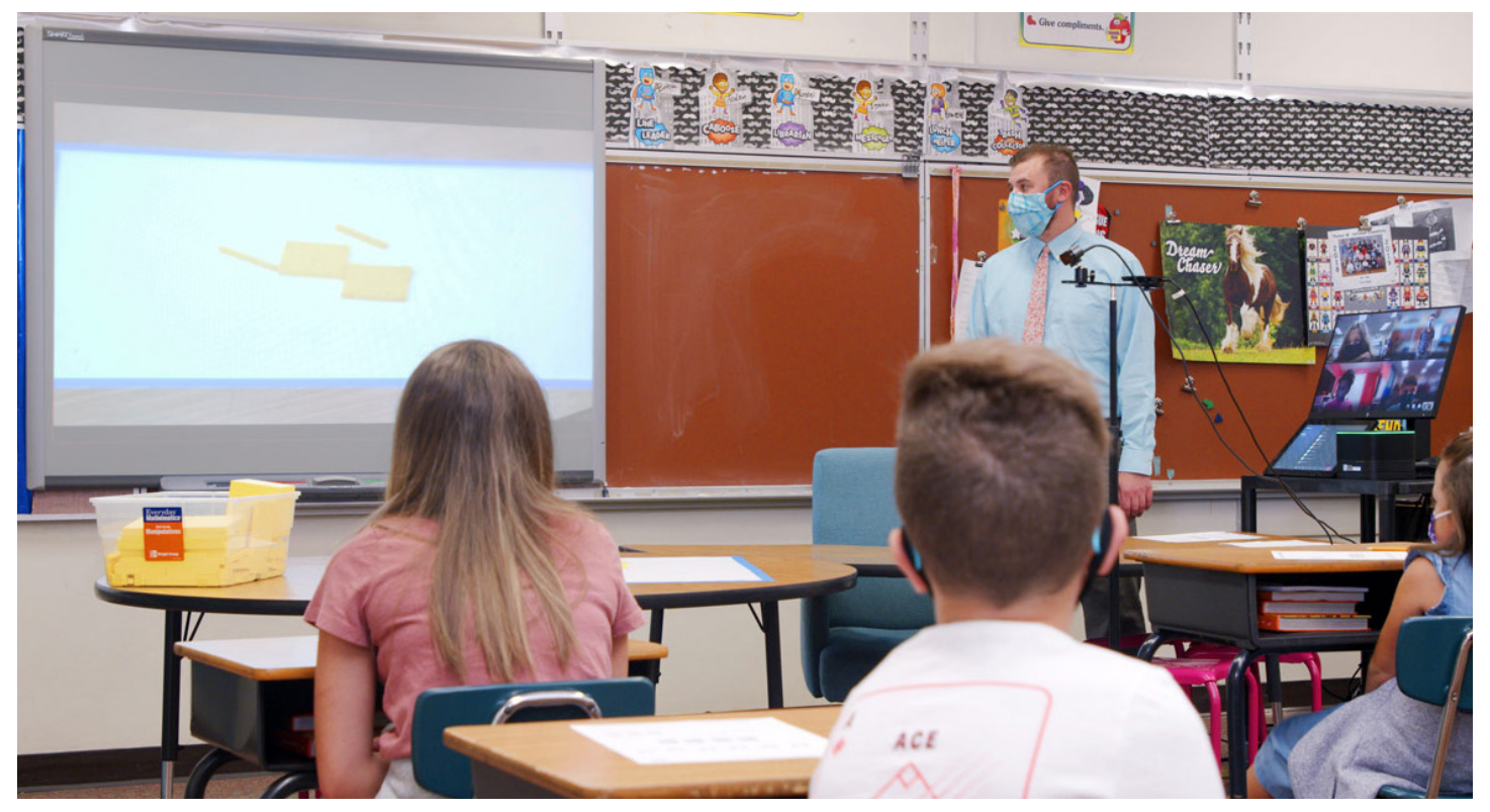
Photo (Above): HP Hybrid Teaching Solution in the classroom — sharing objects with the content camera.

Continued from: "Classroom Configuration of a Hybrid Teaching Solution."