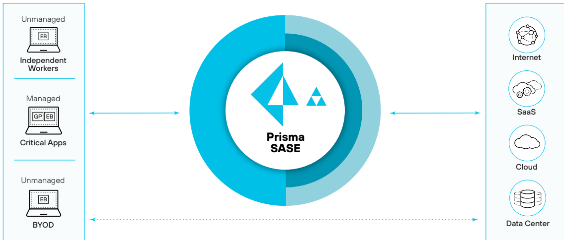
Figure 1. SASE extends to all devices with Prisma Browser