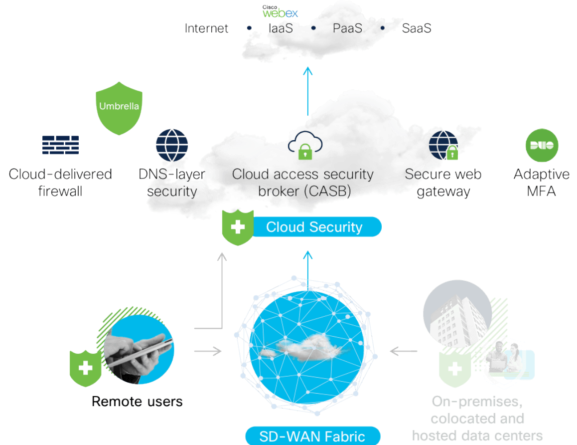
Figure 2: Cisco secure remote access architecture.

Umbrella provides secure connectivity in a single push with a single policy, all part of the most comprehensive cybersecurity platform in the industry.