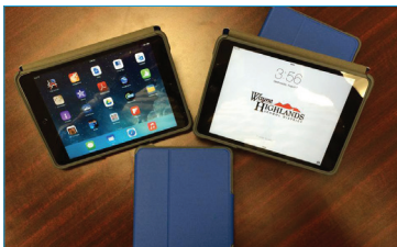
Launched a one-to-one learning environment