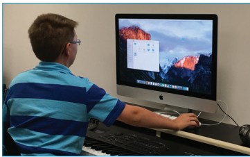
Eliminated long-distance calling and additional transportation costs