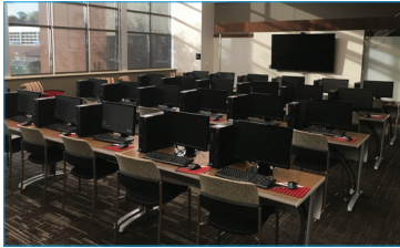
Deployed 320 access points across school district classrooms